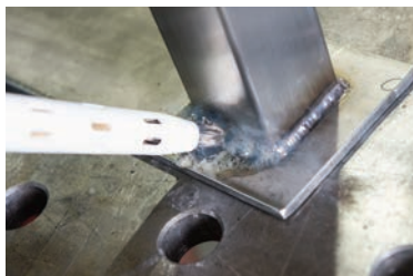
Concentration of power to the weld