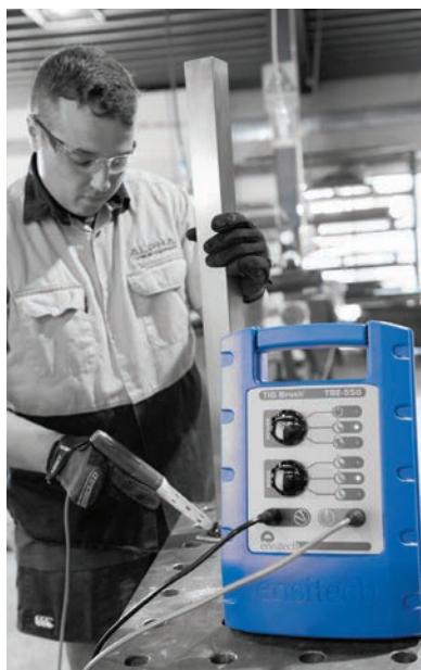
TBX-550 sold separately